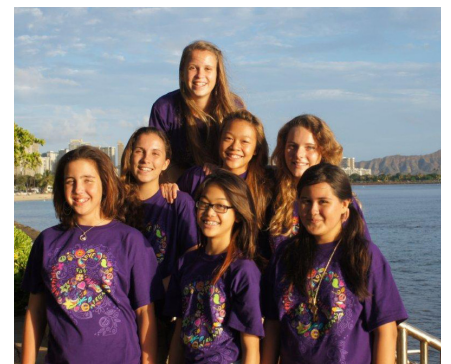
In November, Girl Scout Troop 377 fed the homeless at Kewalo Park for the second year in a row.

Your image of Girl Scouting is always showing. It shows up at every meeting, during all your activities, on all field trips, and at every event. What image of Girl Scouting do you pass on?